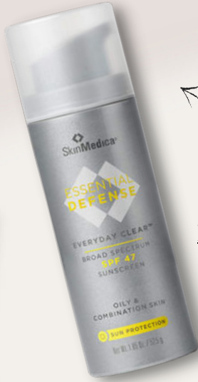
SkinMedica Essential Defense Everyday Clear Broad Spectrum SPF 47

This lightweight, sheer sunscreen is ideal for oily and/or combination skin, giving you the highest level of UVA protection available, along with UVB coverage in a formulation that won't clog pores.