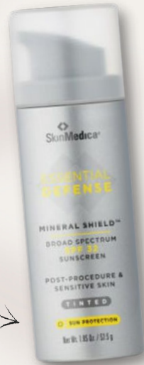
SkinMedica Essential Defense Mineral Shield Tinted SPF 32

A sunscreen with a touch of color, this slightly tinted, lightweight formulation gives you the highest level of UVA protection available, along with UVB coverage in a mineral shield that's gentle to your skin.