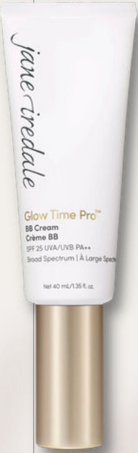
Glow Time Pro BB Cream SPF 25